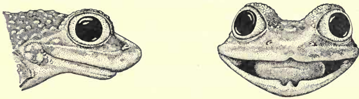
FIG. 130. Staurois hongkongensis , sp. nov., type. Left, side view of head; right, anterior aspect of head with mouth opened to show contour of lower jaw.

41, and 34 mm. The ova are large and the oviducts much swollen in the 45-mm. female. The two largest males have pigmentless, granular nuptial pads on the inner side of the first finger. Since these specimens were collected May 3, the nuptial pads probably are not fully developed. Openings to the vocal sacs are round and situated far back in the mouth; no modification of the skin is evident from without. Sexual dimorphism in size is indicated by the difference in length between these two 41-mm. males and the two females (the type, which measures 48 mm., and the 45-mm. specimen) with